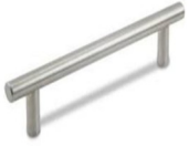
STAINLESS BAR HANDLES