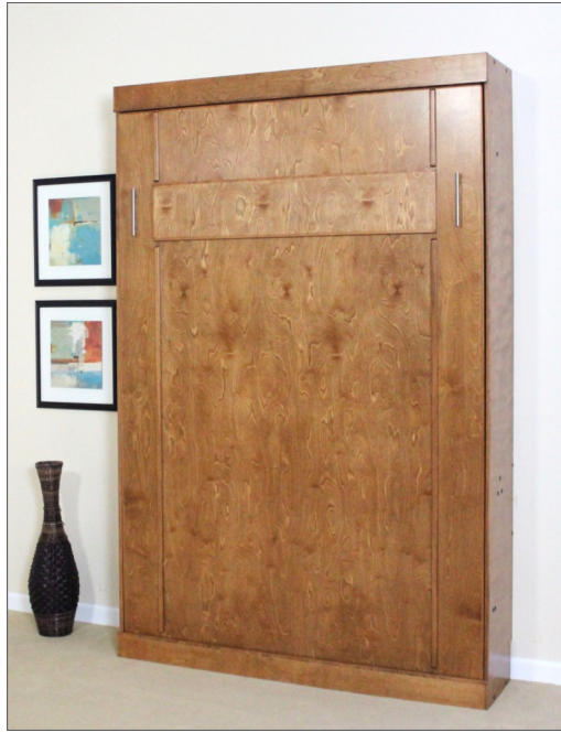
SUNSET FINISH (-S)