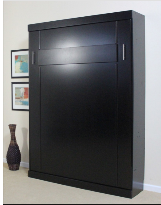
CHOCOLATE FINISH (-D)

Made with REAL WOOD (not a melamine import) in the USA.